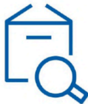
Track your order