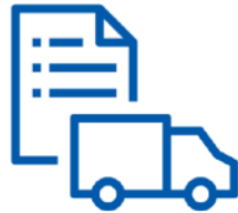
Picking with Delivery services