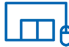
Click and collect