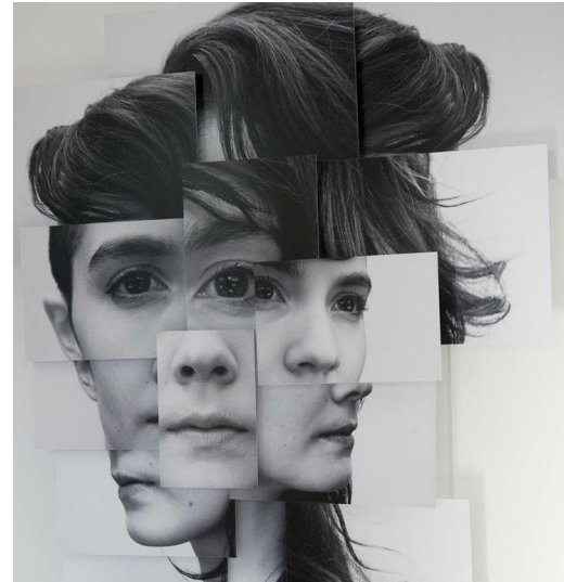
Self-identity seeking and discovery